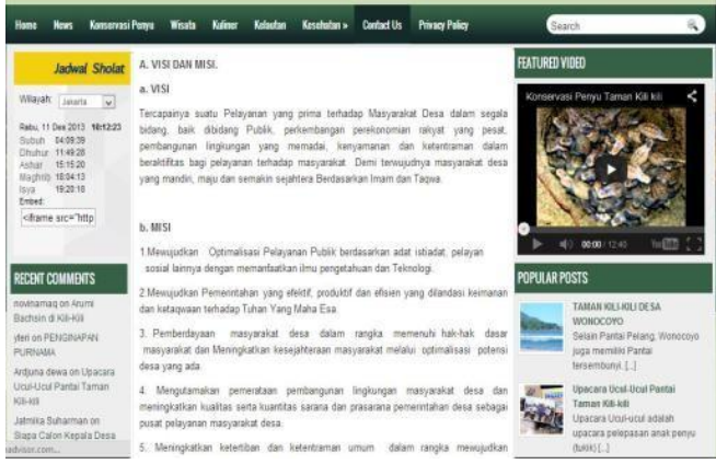
Figure 4: Vision and Mission Page

PRINGSEWU SELATAN.COM WEBSITE RESMI KELURAHAN PRINGSEWU SELATAN