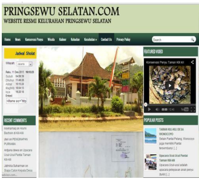
Figure 2: Homepage Implementation

Figure 2 shows Homepage implementation .